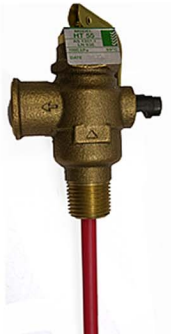
MODEL: HT 55