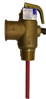
MODEL: HT 575